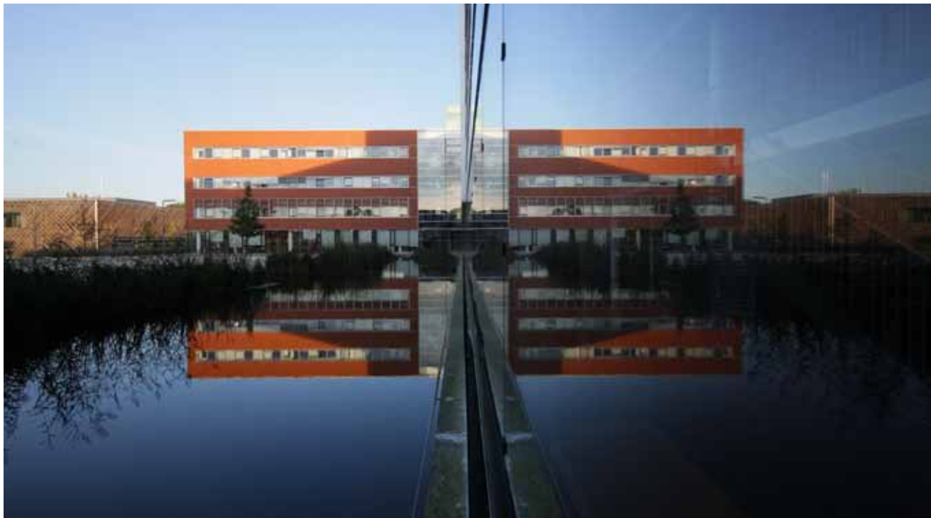
The Biocenter, located on the HighTechCampus in Martinsried