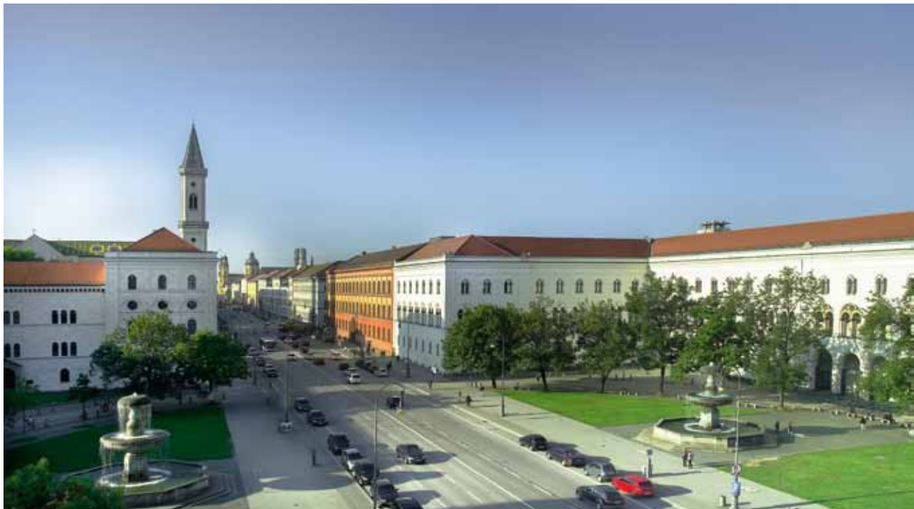
LMU's Main Building with its famous fountain, a prominent attraction in the city center.